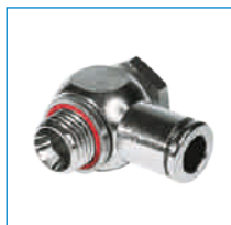
Angled Fittings - Quick Connect Style