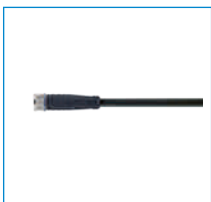
Plug-in Connector Straight Cable 5m - Connector M8