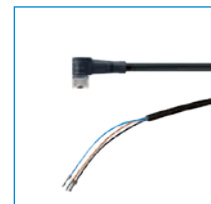
Plug-in Connector Angled Cable 5m - Connector M8