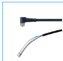
Plug-in connector Angled Cable 5m - Socket M8 (female)