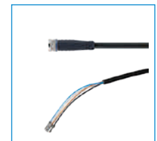
Plug-in connector Straight Cable 5m - Socket M8 (female)