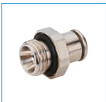
Straight Fittings - Quick Connect Style